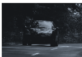
Without HELLA LED Safety DayLights™

In today's world, technology is enabling car drivers and enthusiasts to protect and keep themselves safe while driving on Roads. When you read the latest data about Road accidents in India with one death every 4 minutes and one accident every minute, it's a must for car owners to educate themselves about these safety equipment's and gadgets available in our market. Hella being one of the pioneers and technology leader in the field of Automotive lighting is focusing on improving "Visibility" on Roads as a key measure to ensure safer Roads in India. In their continuous efforts to contribute in the area of automotive lighting to reduce the road accidents in India by introducing high technology products, Hella India Independent Aftermarket has launched LED Safety DayLights™ for Indian Cars.