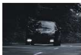
With HELLA LED Safety DayLights™